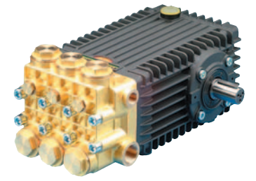
66 Series, Triplex High-Flow And High-Pressure