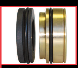
Special seals for car wash applications to 185° F

NEW GUIDING SYSTEM! Optimal sliding of the plunger guide assembly reduces friction between plunger and seals extends life of seals ( Patent Pending )