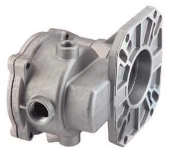
YGR1000P - Gearbox, 24 HP, 1" Improved, higher HP gear boxes for more industrial applications.

888.474.5487 www.generalpump.com email: sales@gpcompanies.com