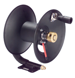
D30006 Expanded hose reel line now available in 50', 100' and 200' sizes ..