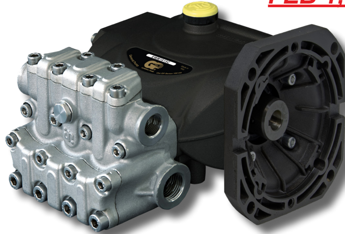
*Shown in right hand configuration. Designate "L" when ordering. EX: EWM1615CL